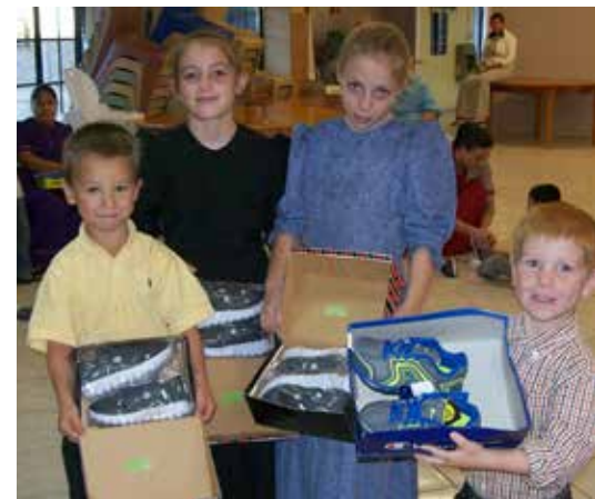
Thank you for the new shoes!