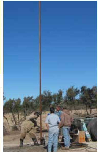
Working at the well