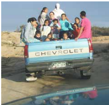
On the way to share Christmas with our neighbors.