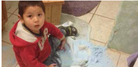
Oops! somebody's in trouble.

Shining Light Children's Home PO Box 164 Grandview, Texas 76050