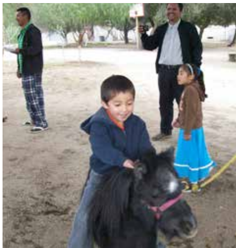
One of the men we caroled for offered pony rides!